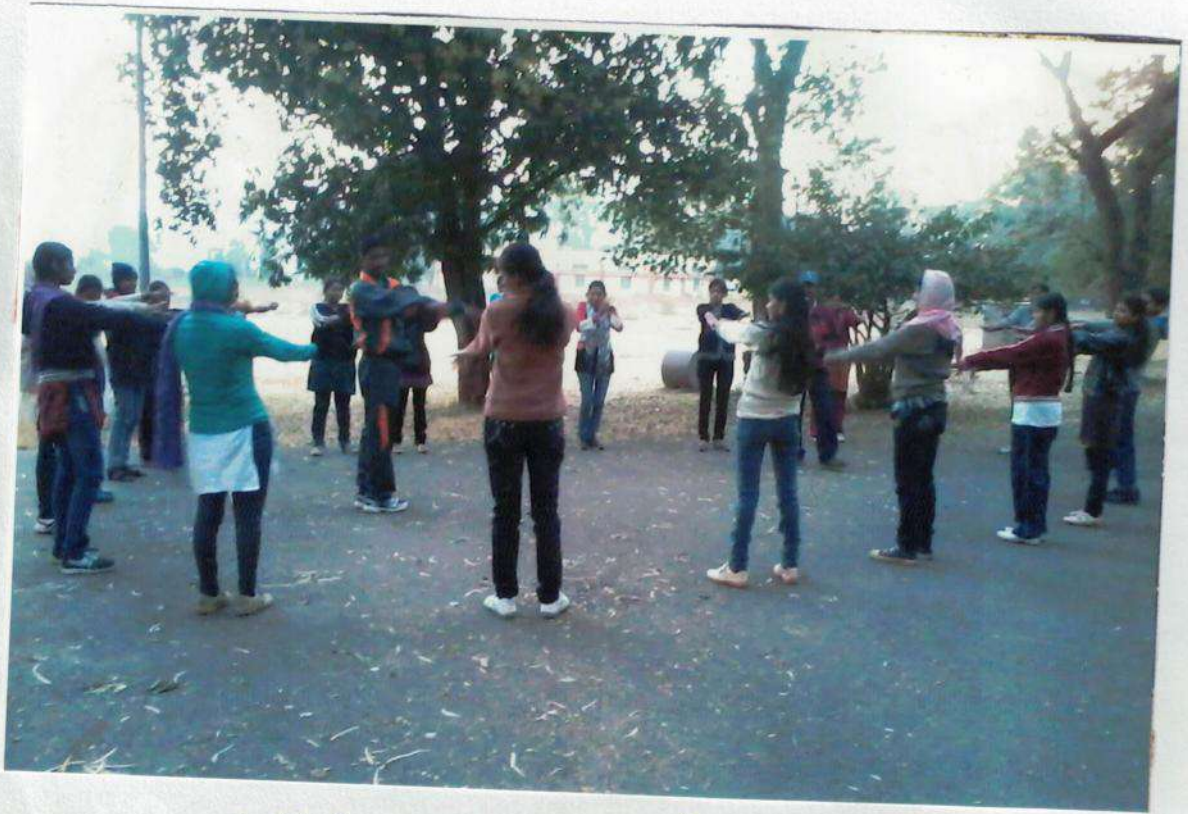
Activity Conducted in Nirbhay Kanya Abhiyan