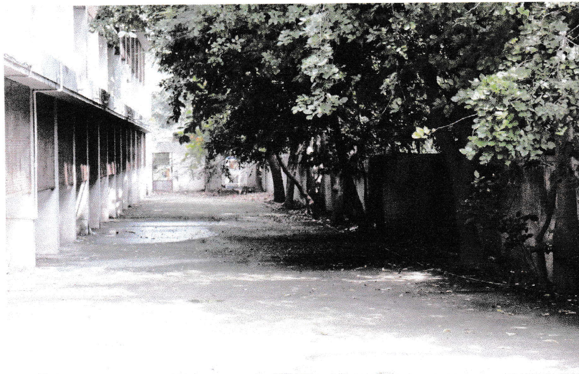
Green campus of the college