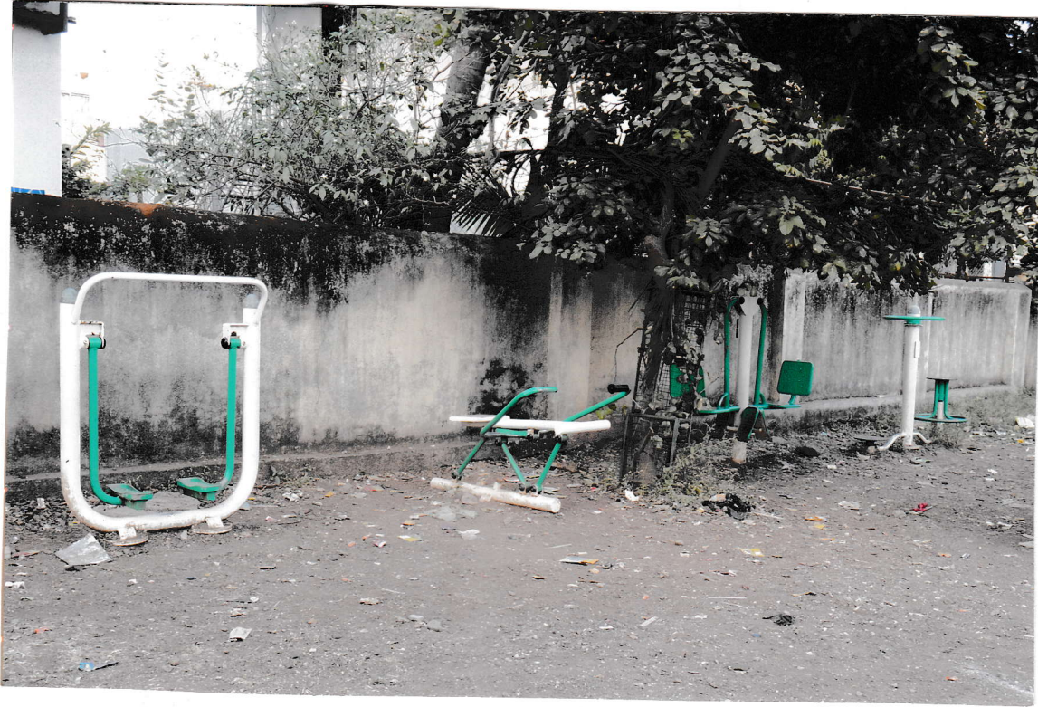
Green Gym in College Campus