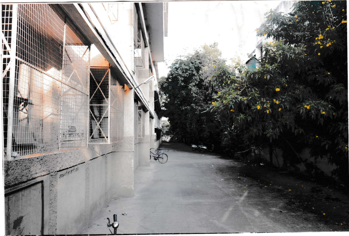
7.1.5 Green Campus of the College