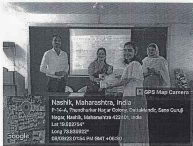
Distribution of Certificates and Cash Prizes to the Prize Winners