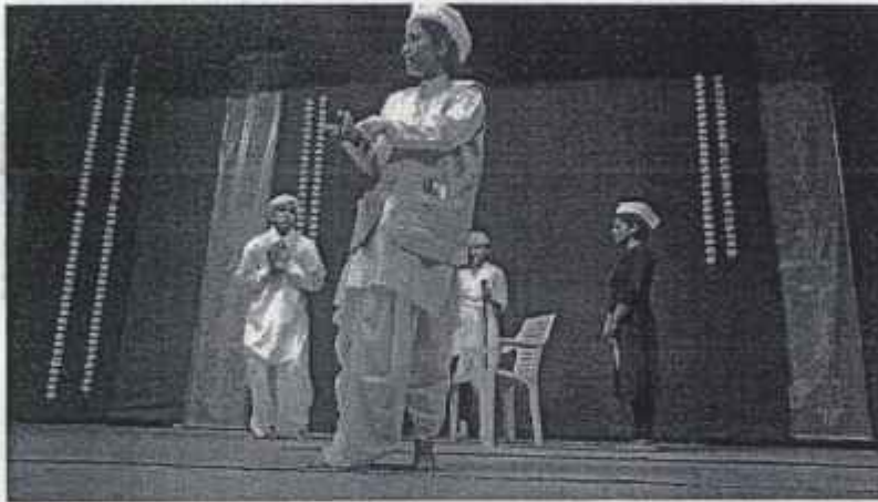
Student performing during the one act play