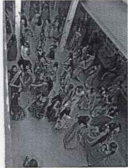
Celebration of Dandiya Raas in College