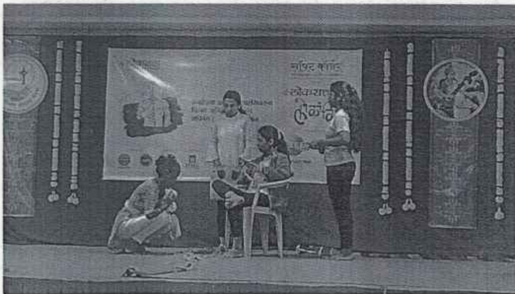
Students performing in the One Act Play: Balirajacha Bali (A Farmer's Suicide)