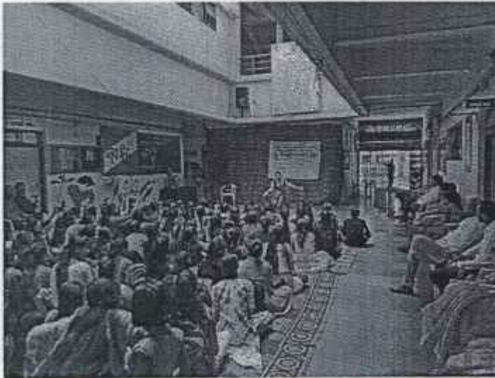
Student performing dance in Annual Gathering of the College

A number of cultural events also take place on this day. The college organized Singing Competition, Solo Dance Competition, Group Dance Competition and College Queen Competition.