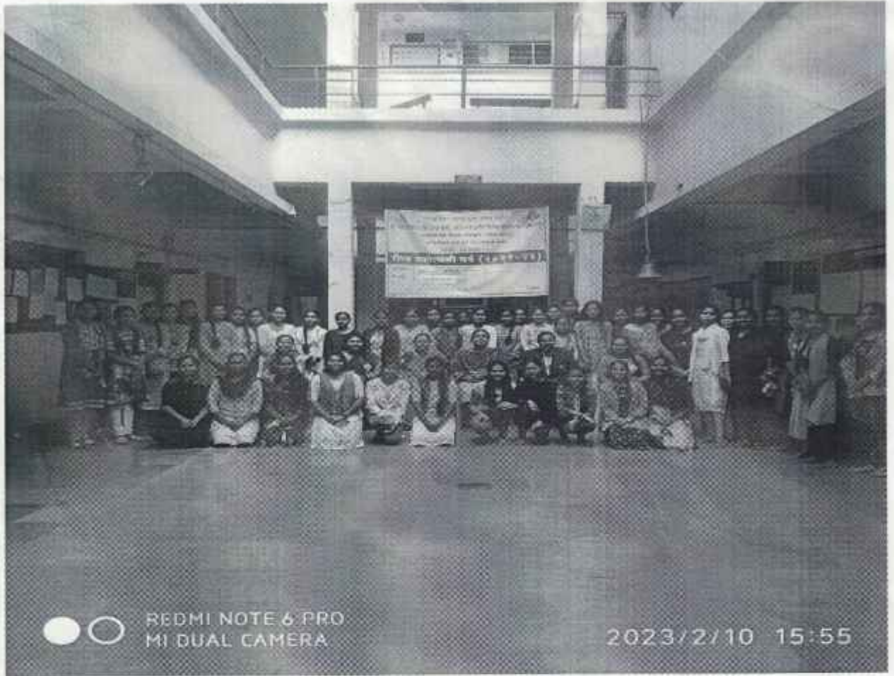
Instructor and student after training in self-defense and karate