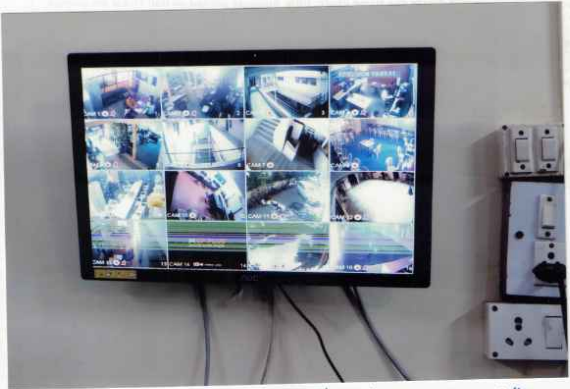
7.1.1 CCTV Cameras installed in the College