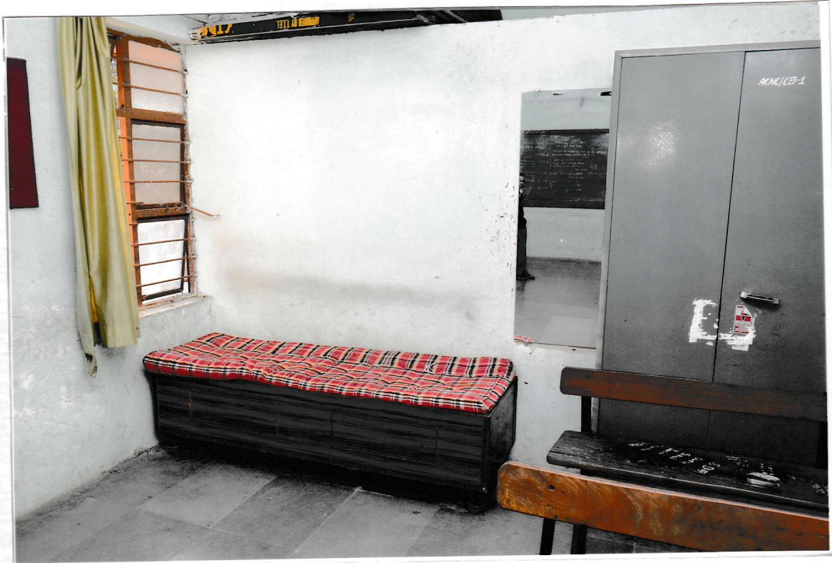
Common Ladies Room for students