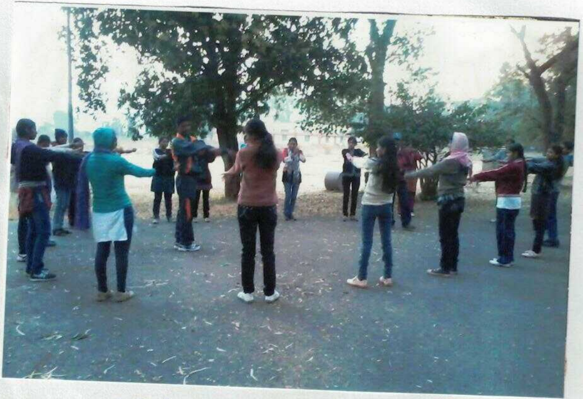
Activity Conducted in Nirbhay Kanya Abhiyan