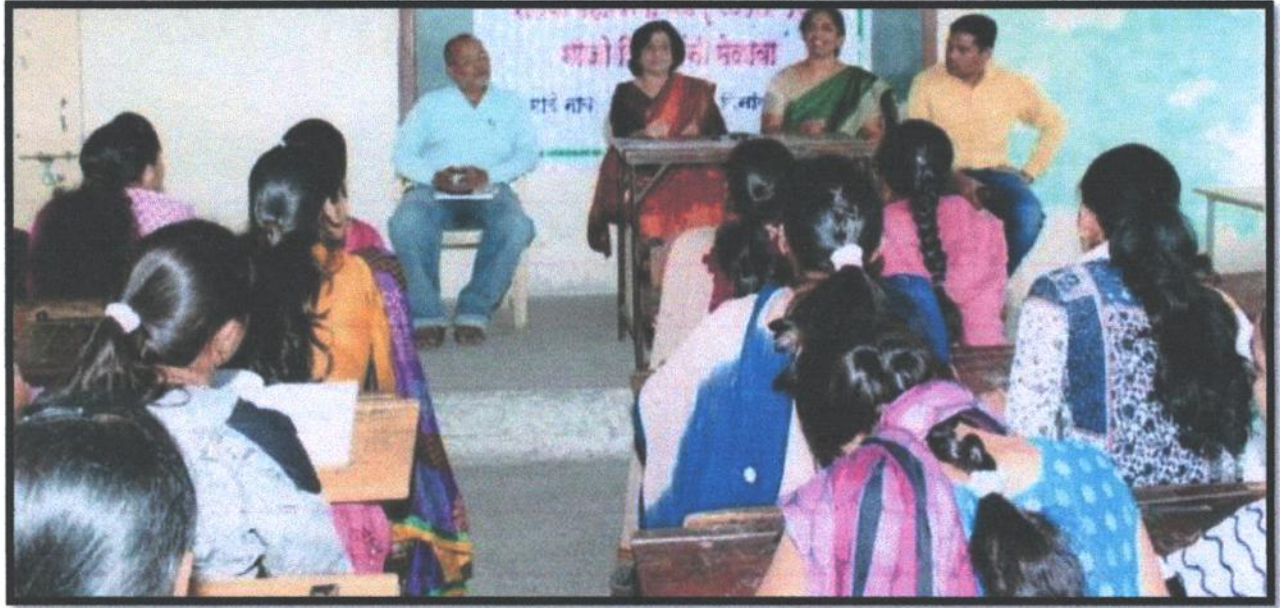
Glimpses of Alumni Meeting